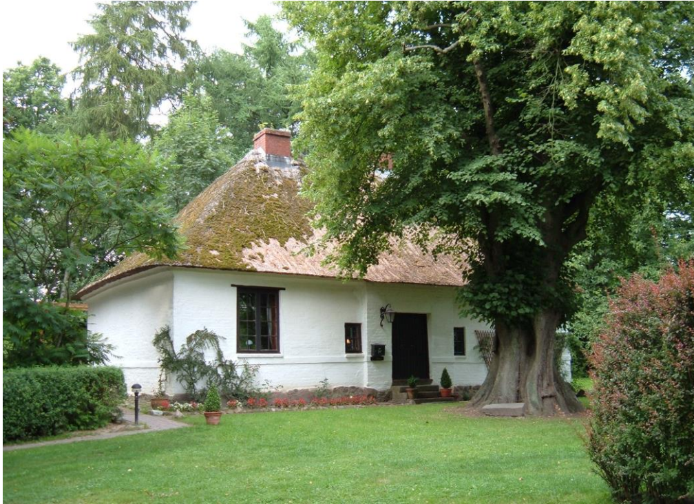
The house near Bad Oldesloe, Germany in which Simons is believed to have worked

Office: (970) 658-2623 Cell: 970-412-7510