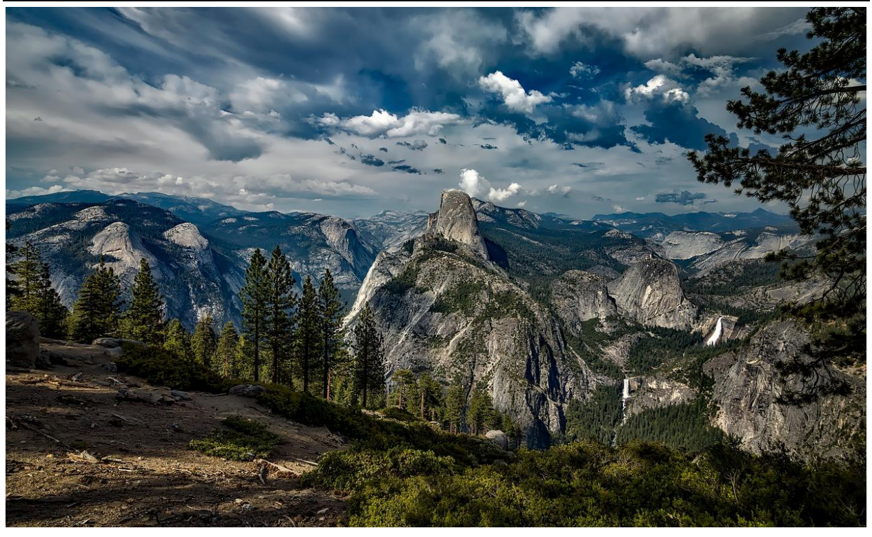
Zoom service starts promptly at 10 am:

https://us02web.zoom.us/j/84841981079?pwd=OG1TMThyZFFQZ1Q0dStpZlJCdURUUT09