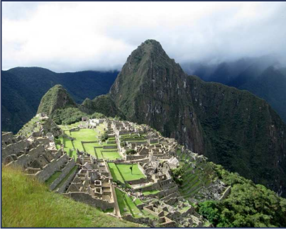
Machu Pichu, Peru